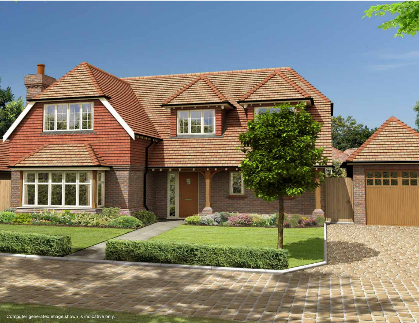
Computer generated image shown is indicative only.