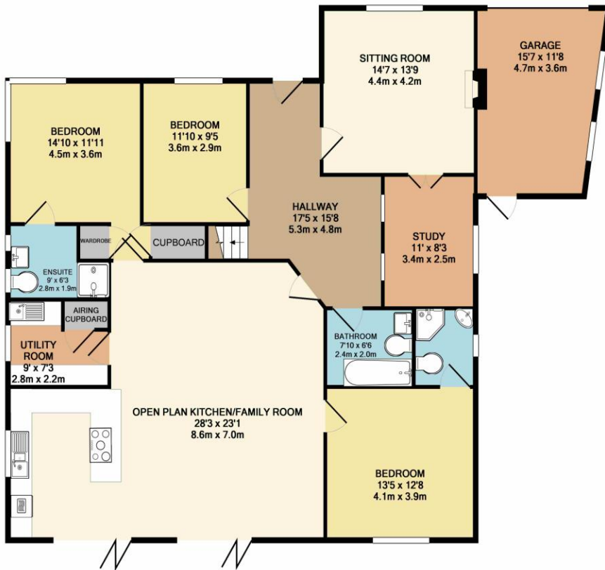
GROUND FLOOR APPROX. FLOOR AREA 1830 SQ.FT. (170.0 SQ.M.)