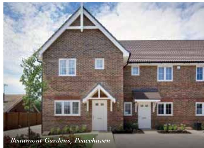
Beaumont Gardens, Peacehaven

Thakeham has a genuine passion to create superior quality homes, in the places where people really want to live. We are a privately owned company, based in West Sussex, building across both East and West Sussex, Surrey, Hampshire and Kent, in villages, small towns and sought after attractive rural locations.