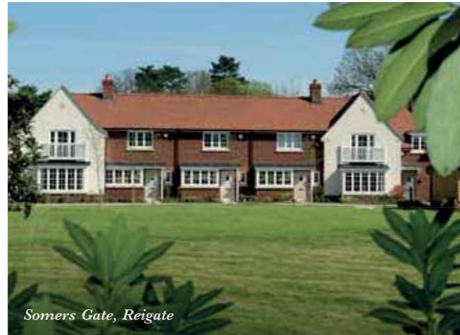
Somers Gate, Reigate