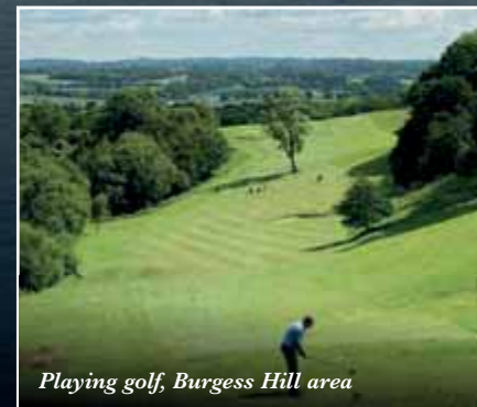
Playing golf, Burgess Hill area

Right in the heart of the town, The Triangle Leisure Centre offers a 25 metre pool, fully-equipped gym and badminton, squash and tennis courts, as well as a comprehensive programme of classes; the supervised crèche and soft play area are sure to keep the children amused. Personal trainers can be found at the Heights Health and Fitness Centre, and at the high tech Strawberry Vibe.