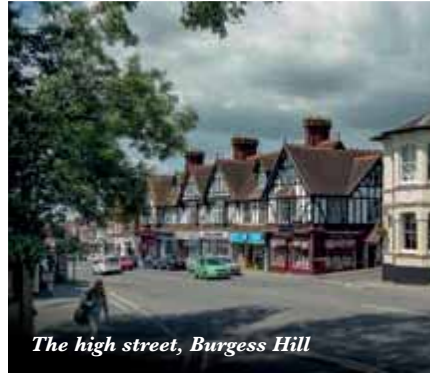
The high street, Burgess Hill