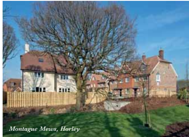
Montague Mews, Horley