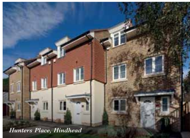
Hunters Place, Hindhead