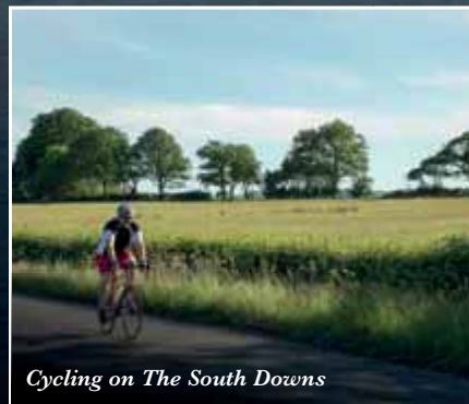
Cycling on The South Downs