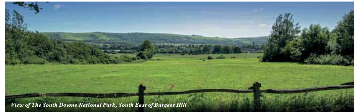
View of The South Downs National Park, South East of Burgess Hill

Nestled beneath the magnificent South Downs and close to meadows and woodlands, Burgess Hill provides a wonderful setting for Thakeham's Valeside Keep development of 2, 3 and 4 bedroom houses and bungalows.