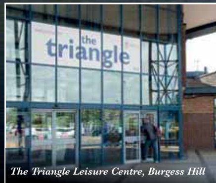
The Triangle Leisure Centre, Burgess Hill

With such beautiful countryside on your doorstep, including the 188 acre Ditchling Common Country Park, it's no surprise that walking, riding and cycling are so popular here. Looking for something a little more action-packed? No problem. The town's wide range of leisure facilities and sporting clubs has something for everyone.