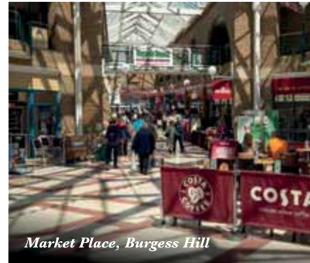
Market Place, Burgess Hill