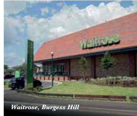
Waitrose, Burgess Hill