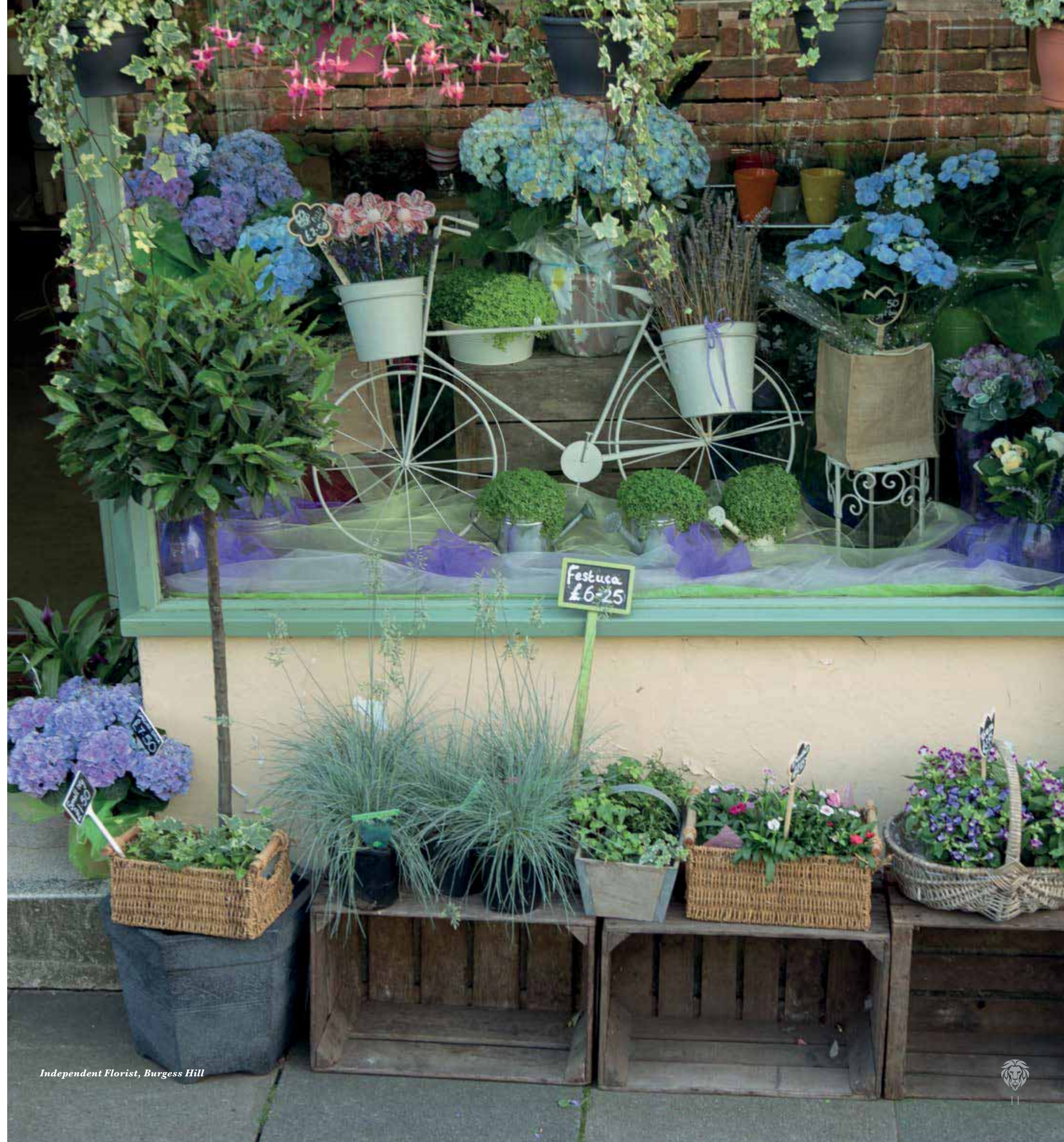
Independent Florist, Burgess Hill

Just a short drive away, Haywards Heath offers even more choice with high street favourites such as M&S, Fat Face, Dorothy Perkins, Clarks, Next and Accessorize; baby and child clothing and toys at JoJo Maman Bébé; and elegant home furnishings and fashion at Laura Ashley.