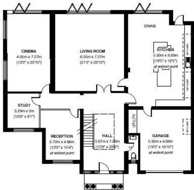
Ground Floor approx 233.15sqm (2,509sqft)