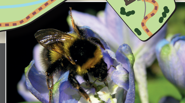
Bumblebees are important to wildlife preservation

We hope everyone will take part in looking for the bumblebees and growing plants to encourage them to flourish.