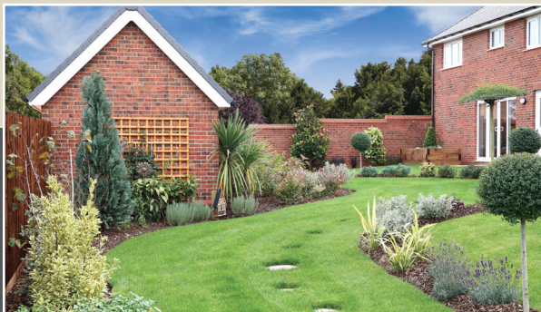
Beautiful borders filled with lavender attract bumblebees

Finally, bumblebees also need a place to shelter and build their nest to maintain a successful colony throughout their life-cycle.