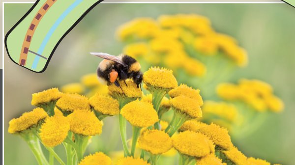
Whole ecosystems are dependant upon bumblebees flourishing