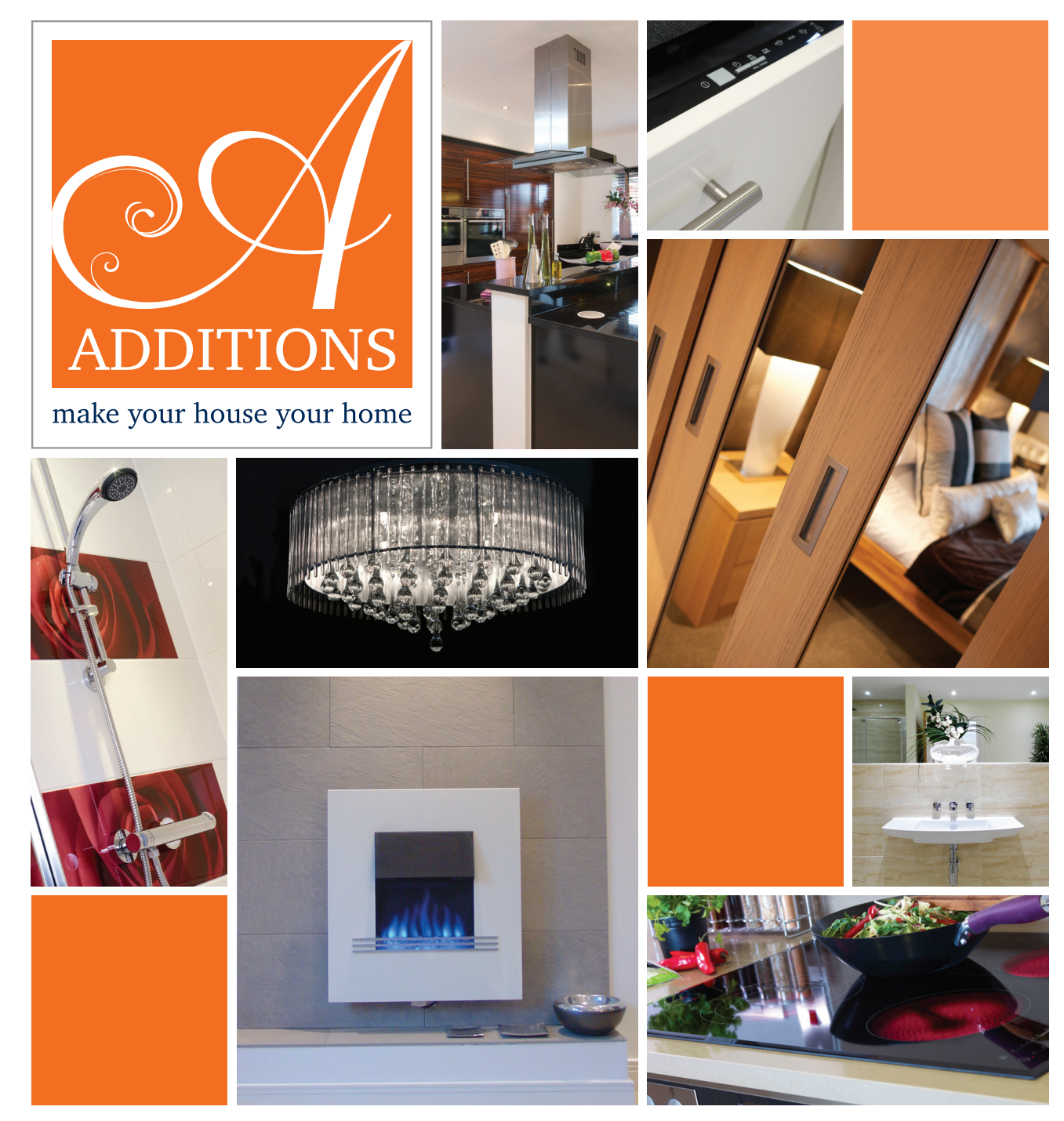
Although we make every effort to ensure that as many Additions choices as possible are available to you, not every development offers all the range shown opposite. Please be aware that orders can only be accepted up to certain stages of the construction process. Therefore we recommend that you consult our Sales Advisor.