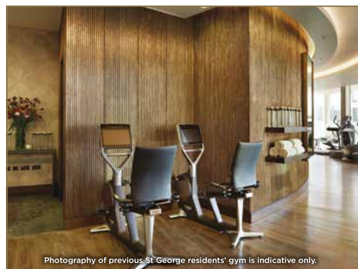
Photography of previous St George residents' gym is indicative only.