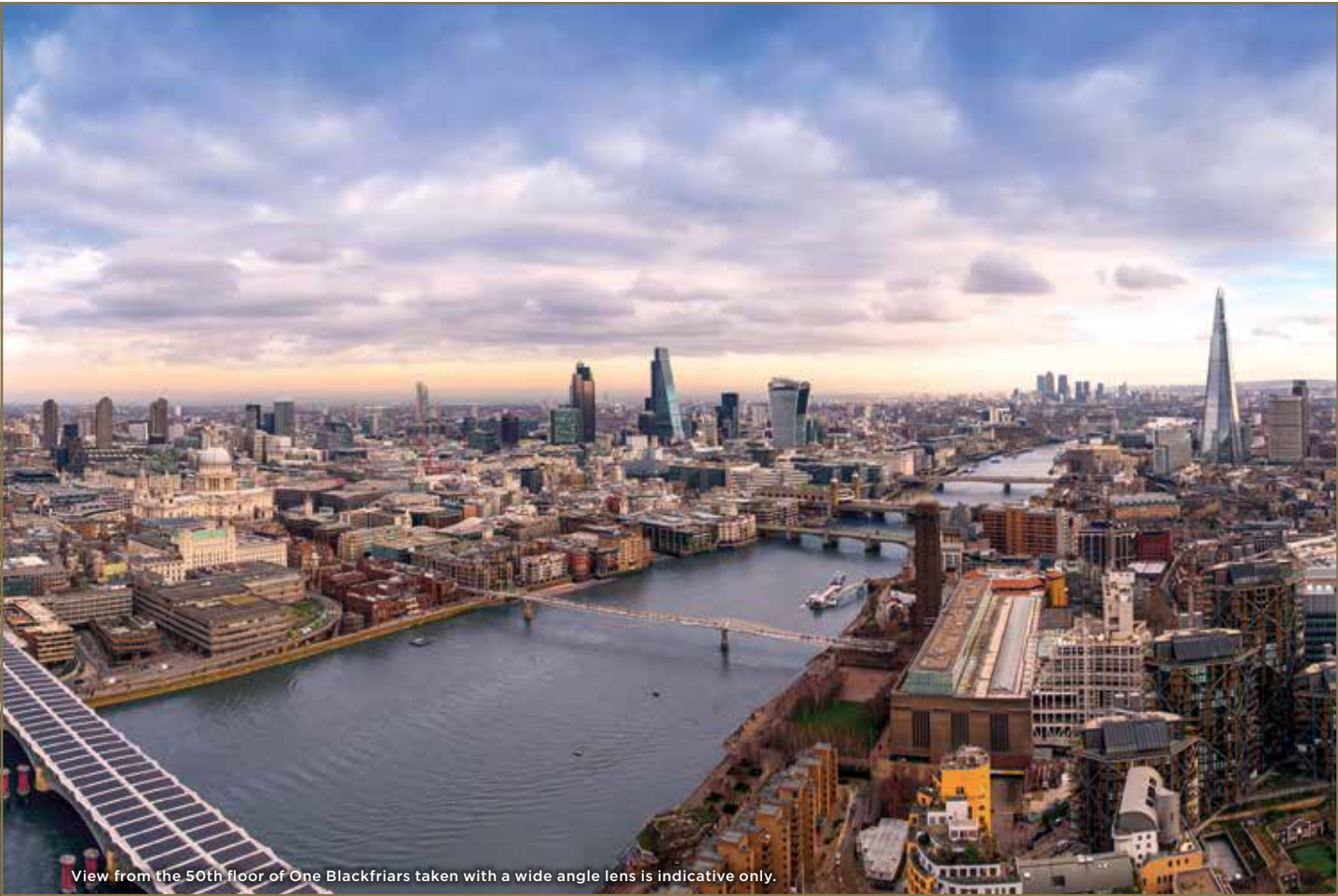
View from the 50th floor of One Blackfriars taken with a wide angle lens is indicative only.