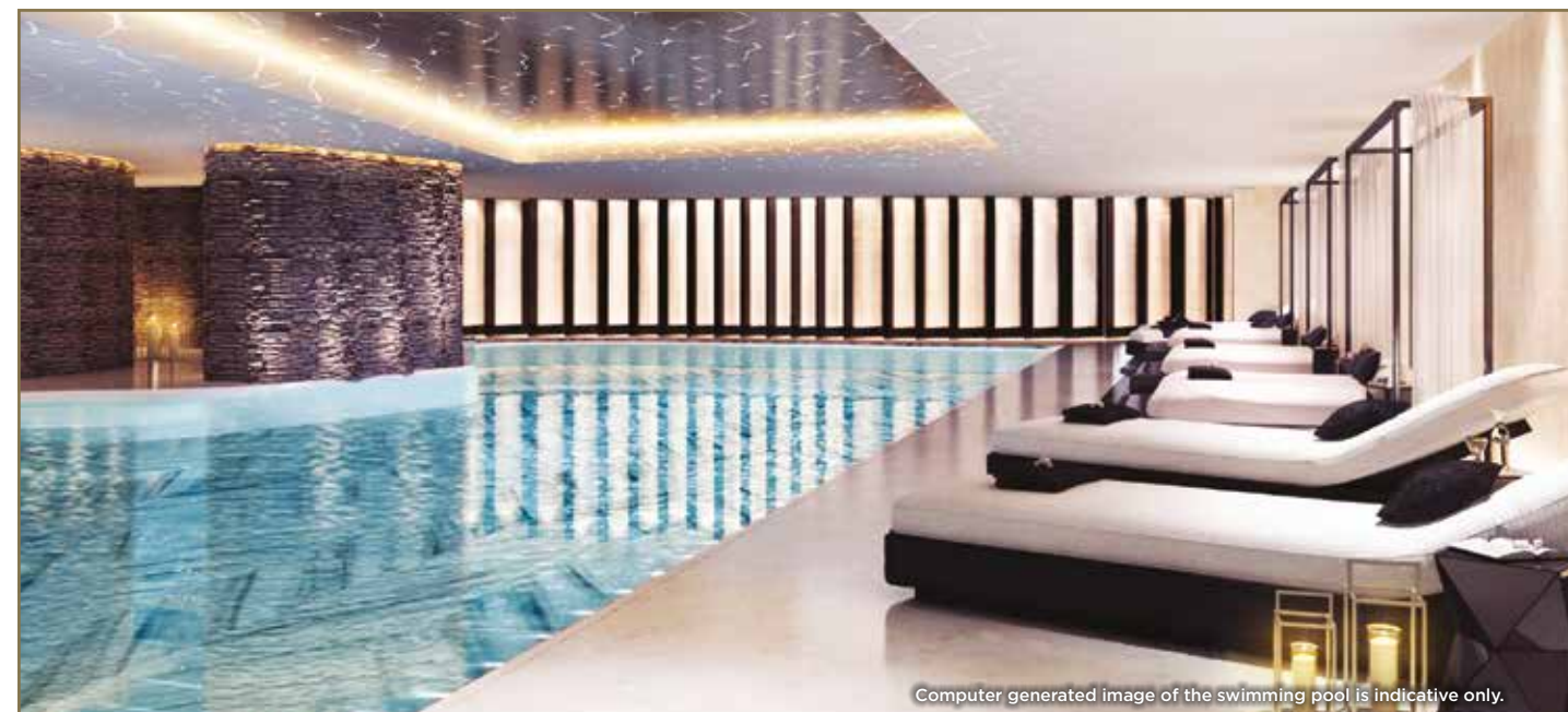
Computer generated image of the swimming pool is indicative only.