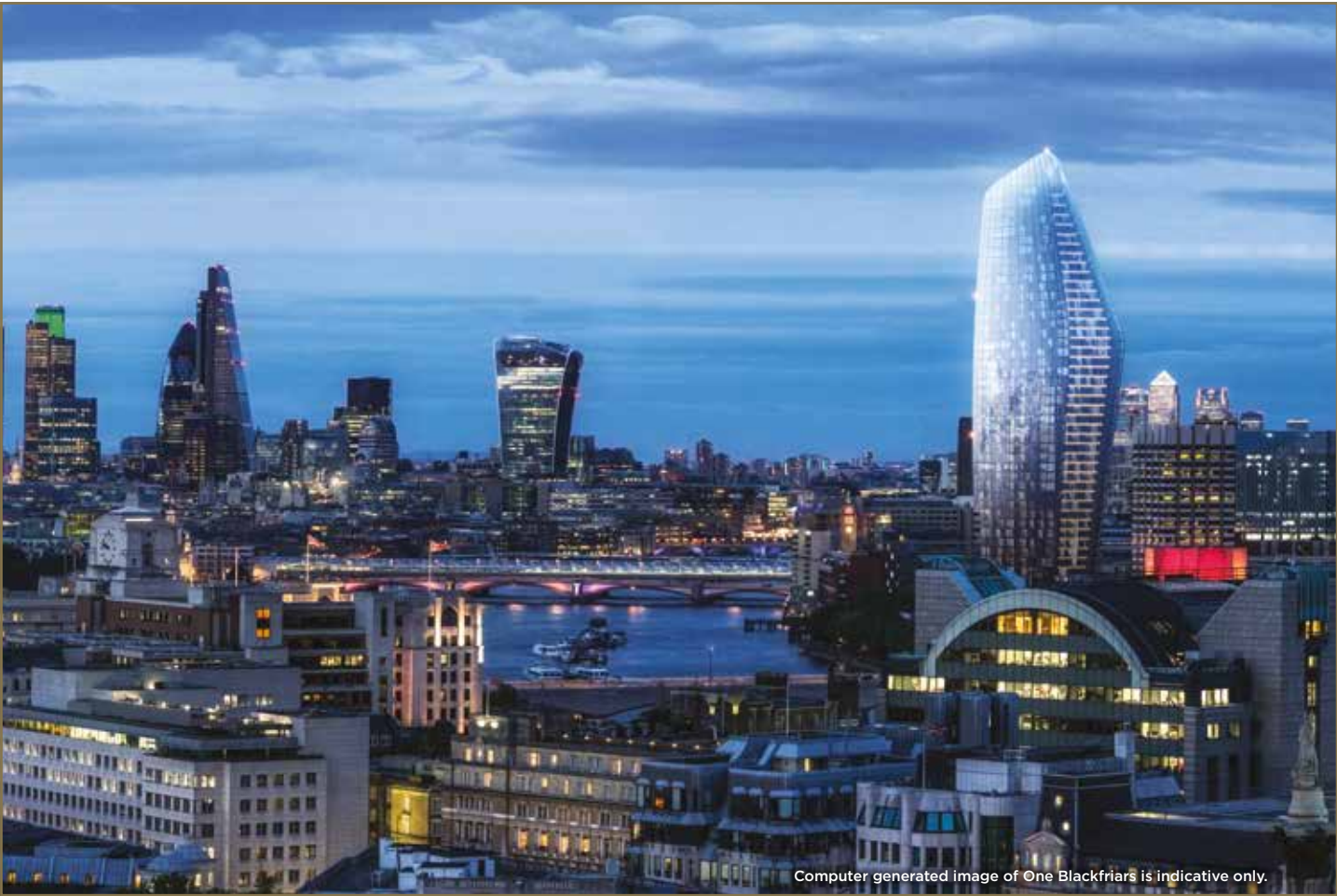
Computer generated image of One Blackfriars is indicative only.