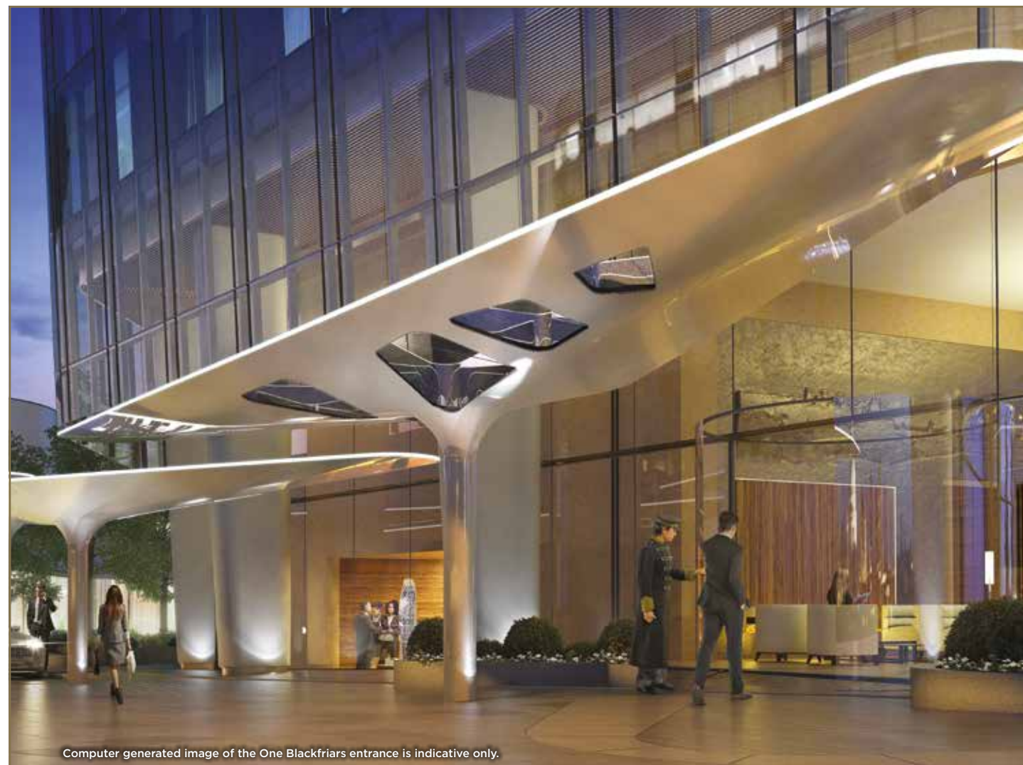
Computer generated image of the One Blackfriars entrance is indicative only.