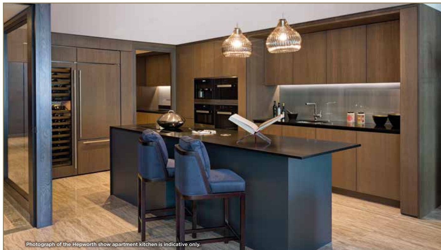
Photograph of the Hepworth show apartment kitchen is indicative only.