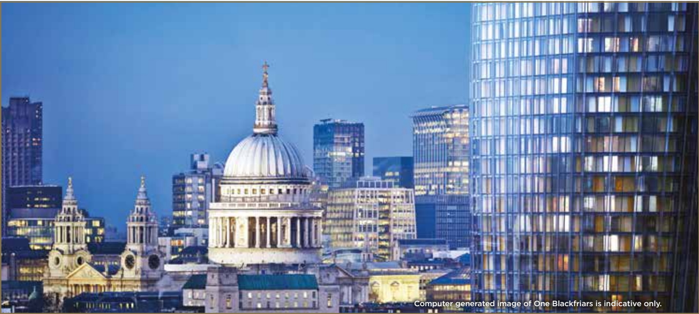
Computer generated image of One Blackfriars is indicative only.