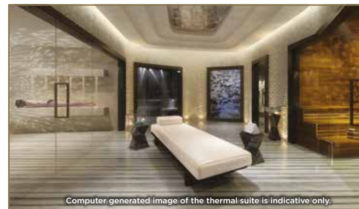
Computer generated image of the thermal suite is indicative only.