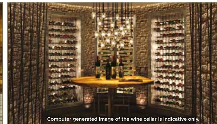
Computer generated image of the wine cellar is indicative only.