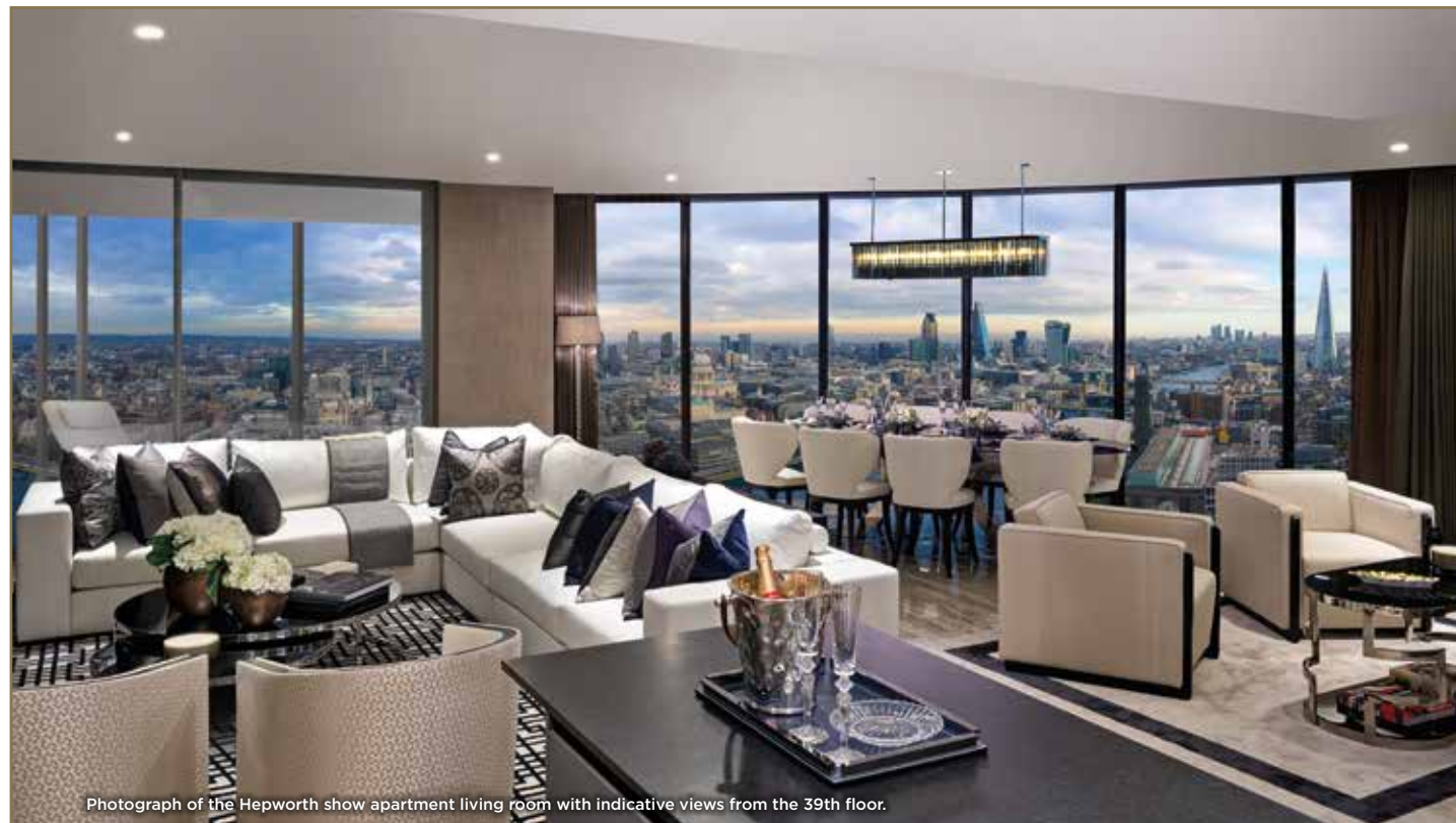
Photograph of the Hepworth show apartment living room with indicative views from the 39th floor.