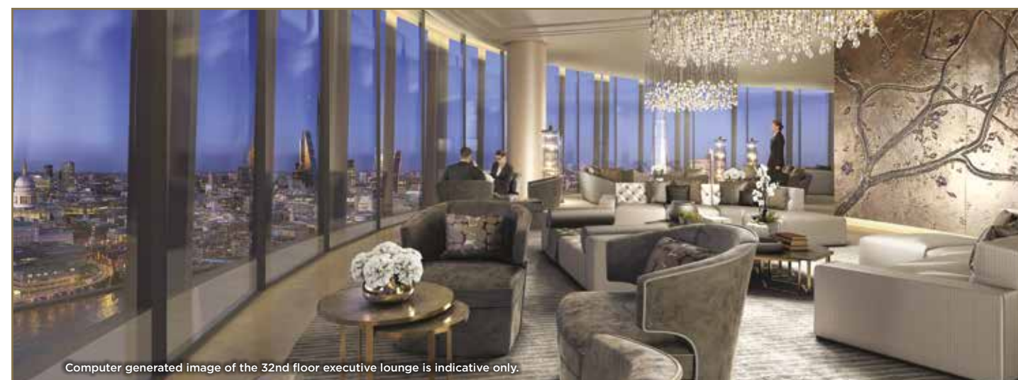
Computer generated image of the 32nd floor executive lounge is indicative only.