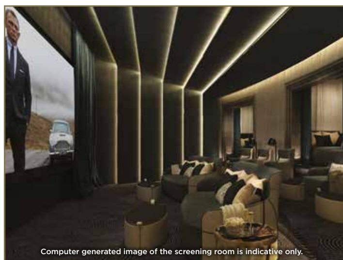
Computer generated image of the screening room is indicative only.