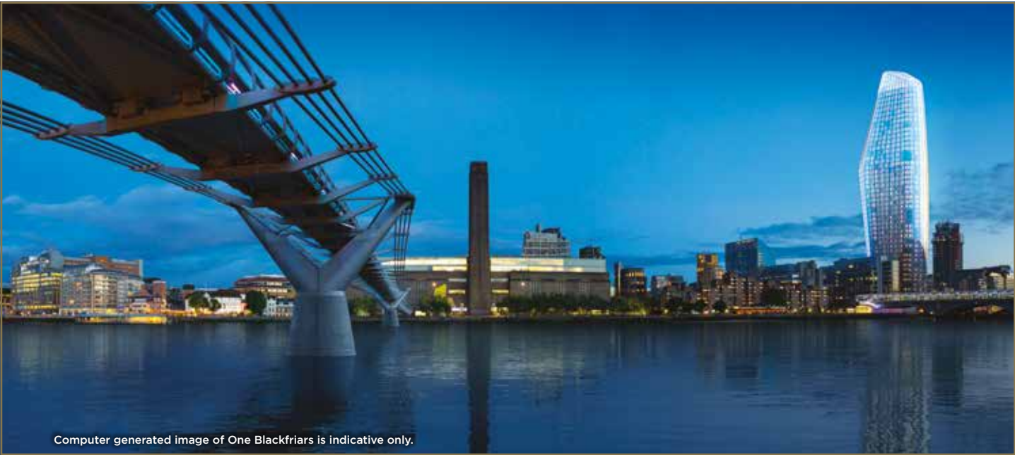
Computer generated image of One Blackfriars is indicative only.