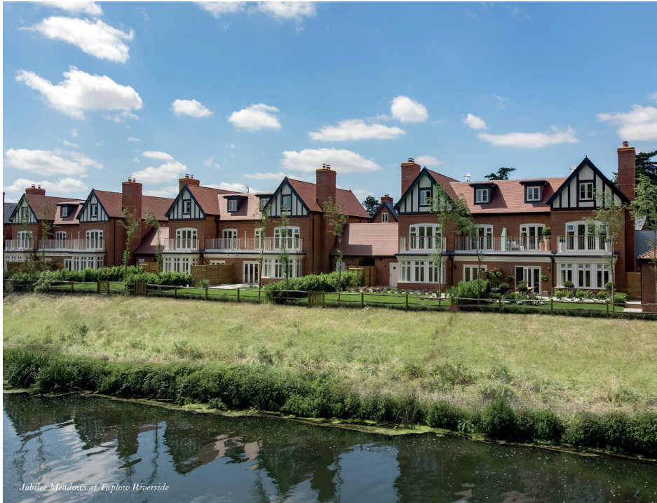
Jubilee Meadows at Taplow Riverside