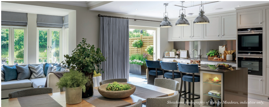
Starchome photography of Jubilee Meadows, indicative only.