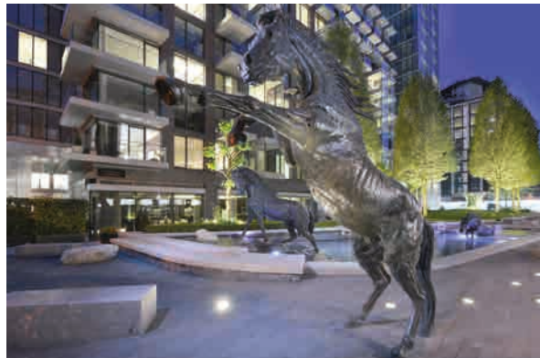
Photography depicts the feature lake at Stanmore Place and the Piazza at Goodman's Fields and is indicative only.