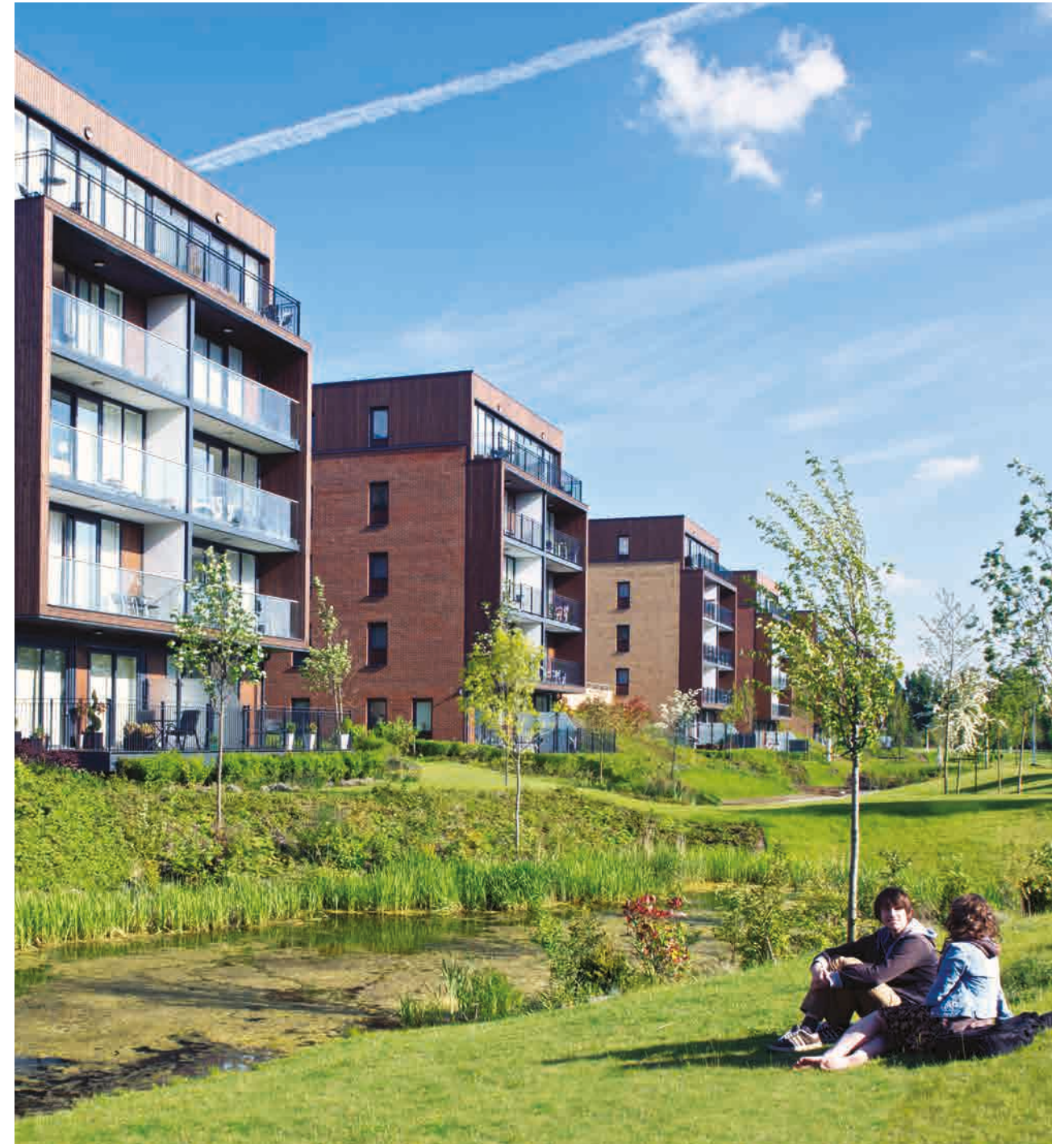
Photography depicts Kidbrooke Village and is indicative only.