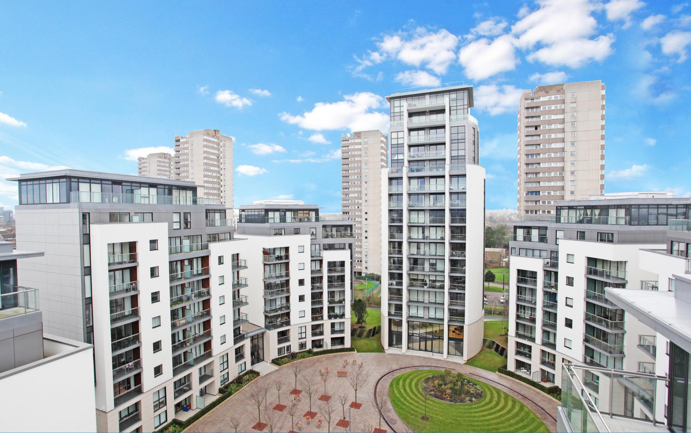
Pump House Crescent, Brentford, TW8