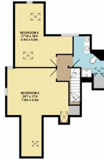
2ND FLOOR APPROX. FLOOR AREA: 655 SQ.FT. (60.8 SQ.M.)

TOTAL APPROX. FLOOR AREA: 3073 SQ.FT. (285.5 SQ.M.)