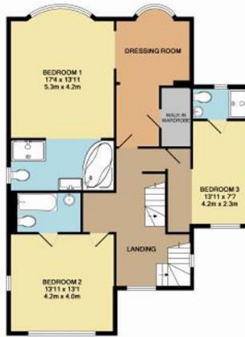
1ST FLOOR APPROX. FLOOR AREA: 1070 SQ.FT. (99.4 SQ.M.)