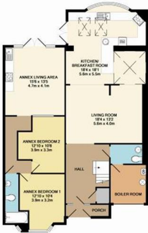
GROUND FLOOR APPROX. FLOOR AREA: 1349 SQ.FT. (125.3 SQ.M.)