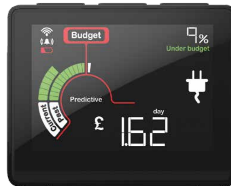
SMART ENERGY DISPLAY

Our commitment to your environment doesn't stop there. By building characterful homes set in open green spaces with transport links and amenities nearby, we strive to provide the best possible quality of life for anyone who buys a Countryside home.