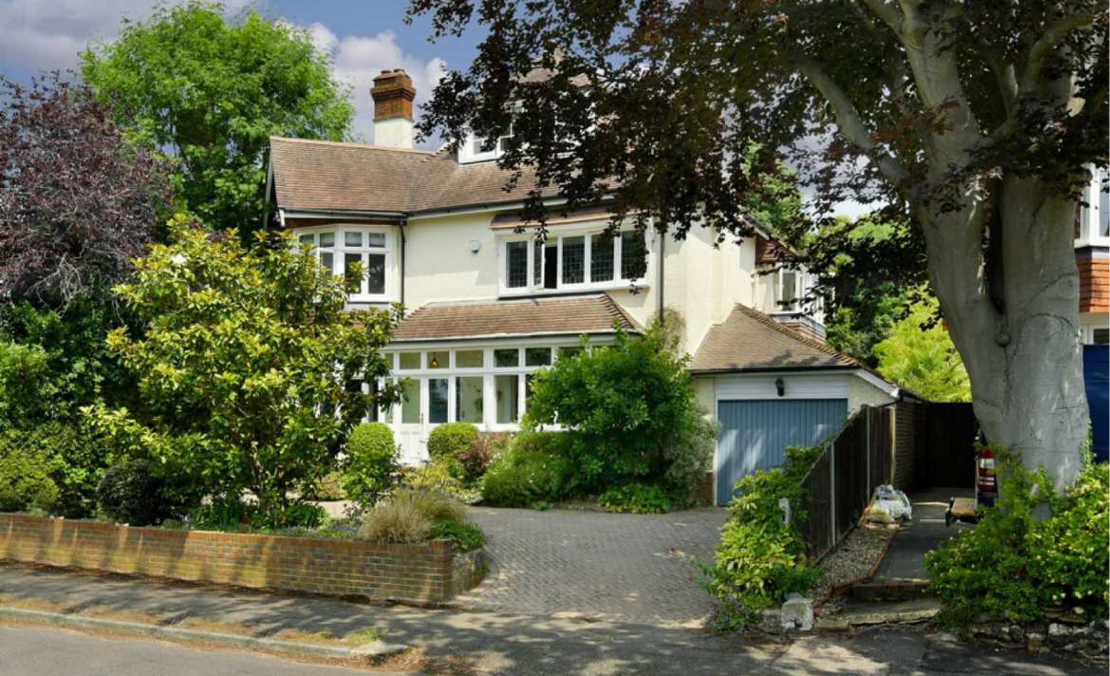
Links Road, Epsom, KT17 3PP