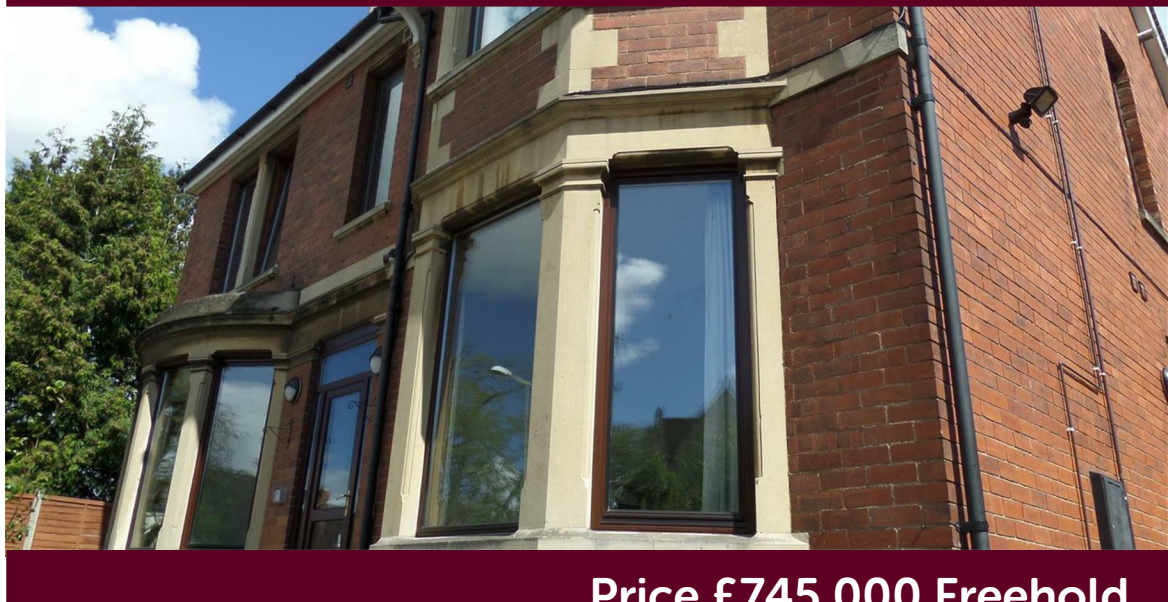
Price £745,000 Freehold

Belvoir are delighted to over this superb investment opportunity for sale. This substantial Georgian house has been converted into 7 self contained one bedroom apartments. The apartments are currently tenanted and are offered in first class condition. We have let the apartments for many years and they have consistently been popular with low levels of void periods. The apartments are finished to high standard and consequently command good rents.