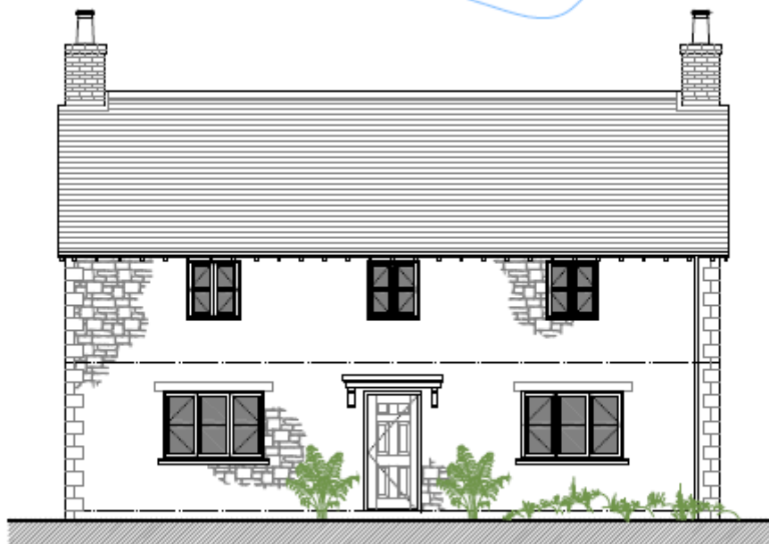
SOUTH ELEVATION (FRONT)

Chesters Commercial Ltd, for themselves and for the vendor of this property, or as the case may be, lessor whose agents they are, give notice that:-