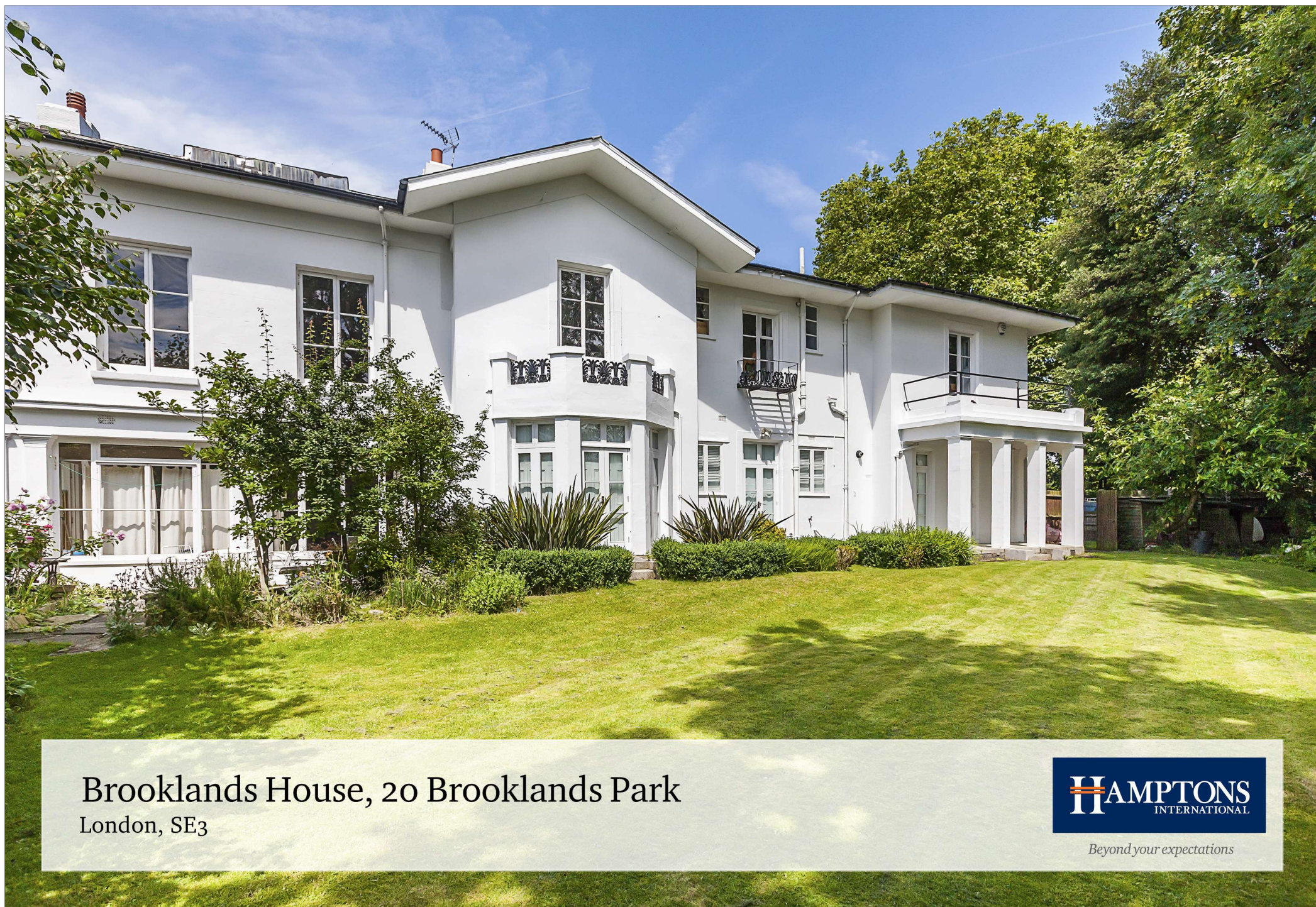
Brooklands House, 20 Brooklands Park London, SE3