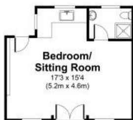
Old Dairy Cottage