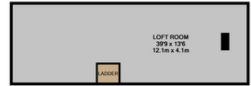
2ND FLOOR APPROX. FLOOR AREA 48.7 SQ.M. (1649 SQ.FT.)