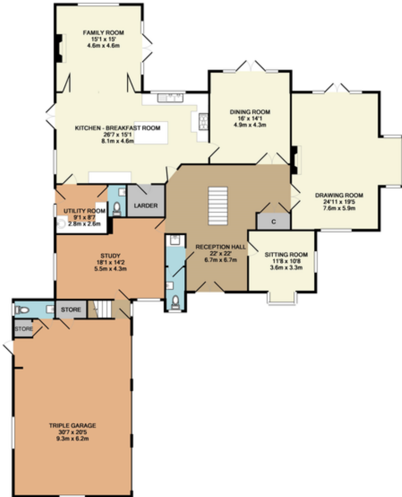
GROUND FLOOR APPROX. FLOOR AREA 265.0 SQ.M. (883 SQ.FT.)