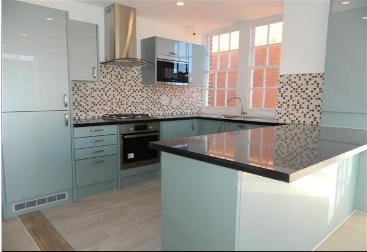
21 Former Nurses Residence, Canterbury Road, Margate