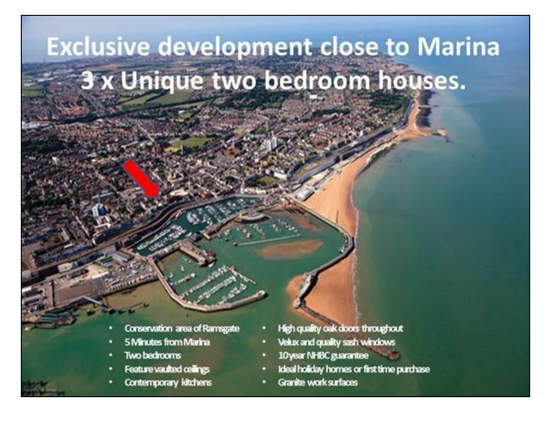
Plot 1, Sion Passage, Ramsgate £ Price on Application