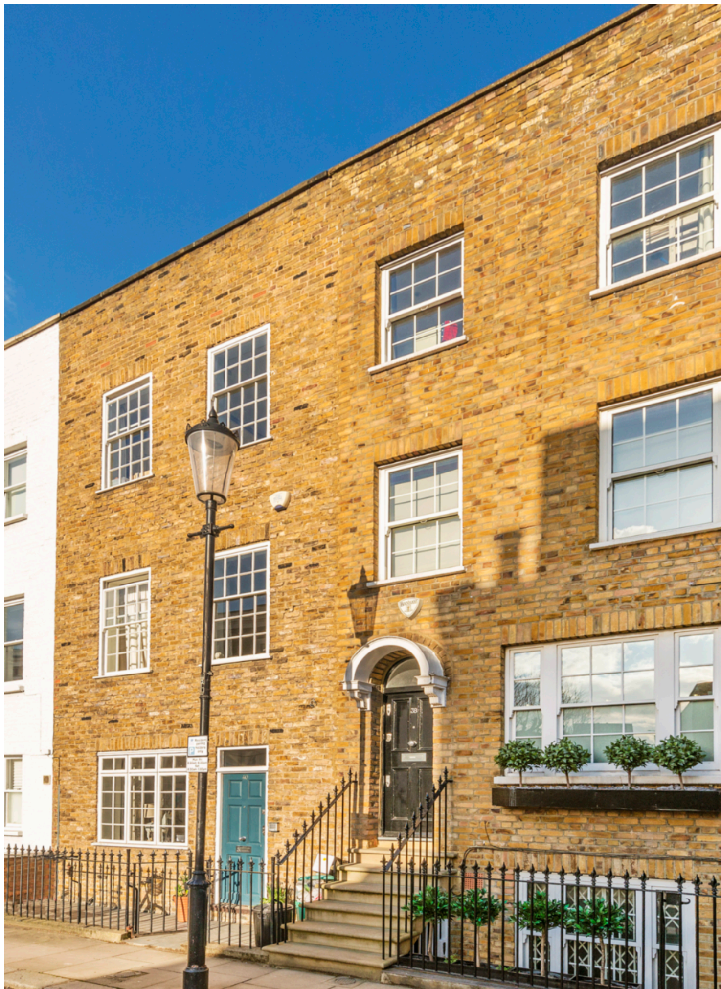
Princedale Road, Holland Park W11