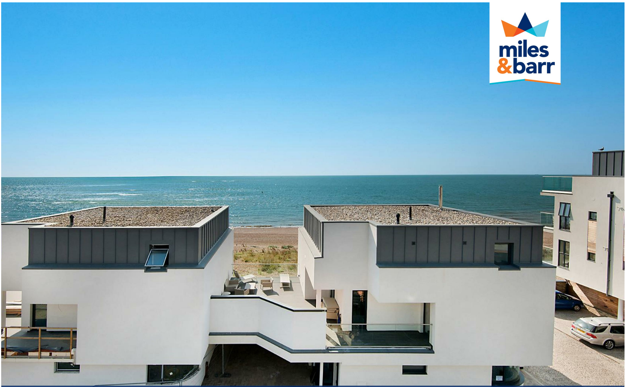
VILLA, OYSTER FISHERMANS BEACH HYTHE