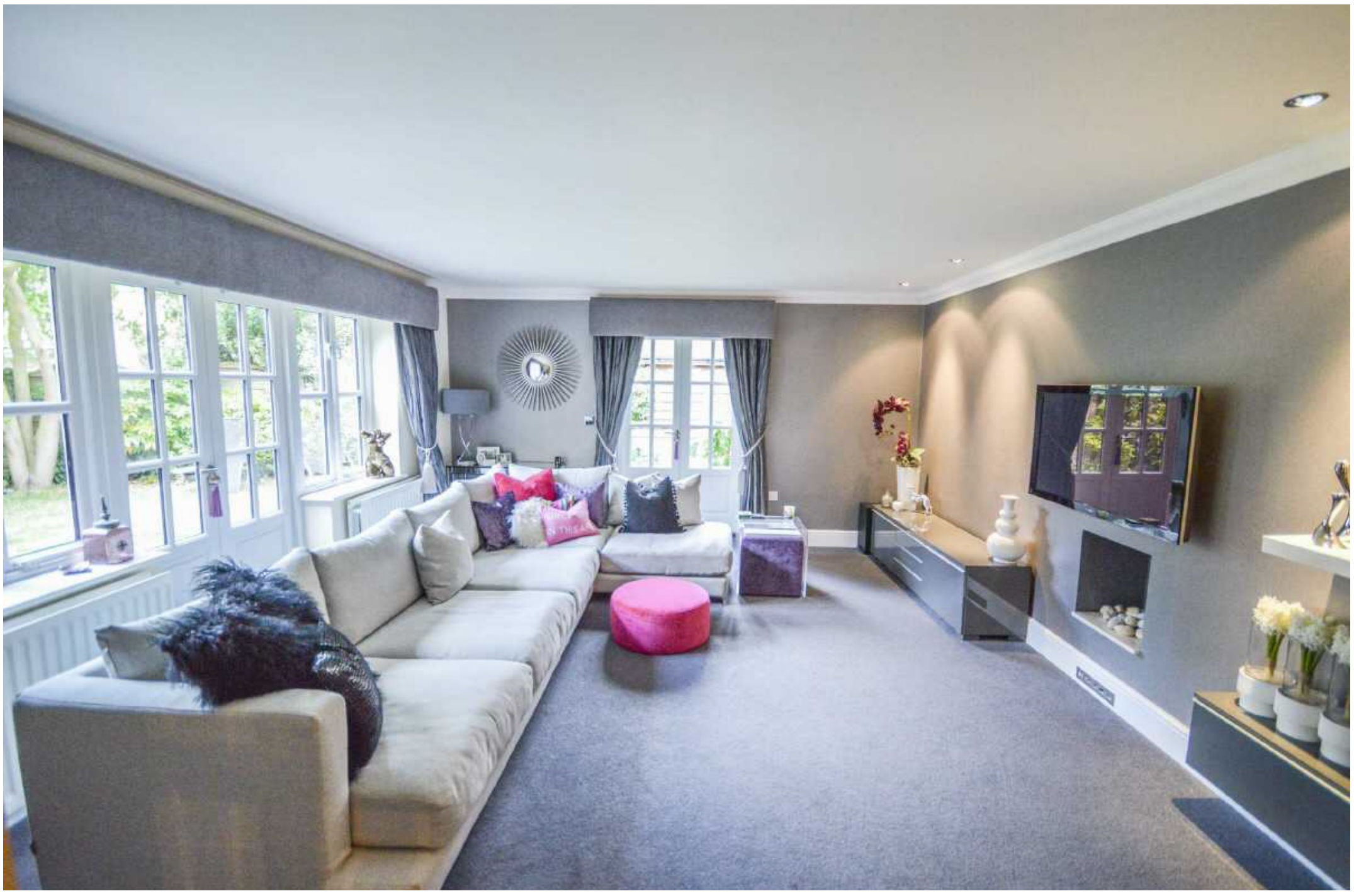
21 High Street, Ware, Hertfordshire, SG12 9BN 01920 330330